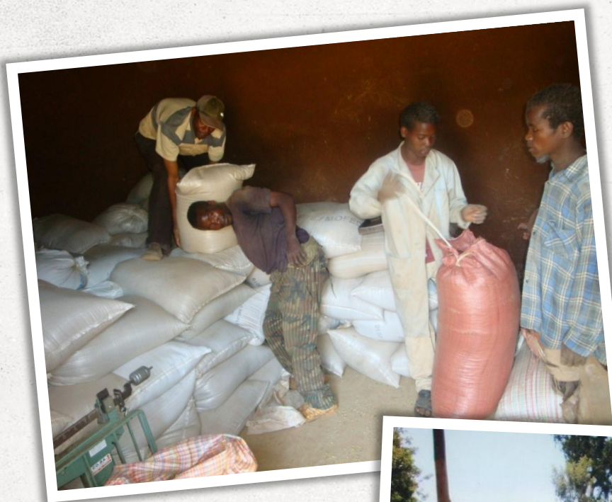
Food grains being stored in a warehouse

Once reliable suppliers had been secured, the food relief was purchased and transported to the six child development centres for storage.