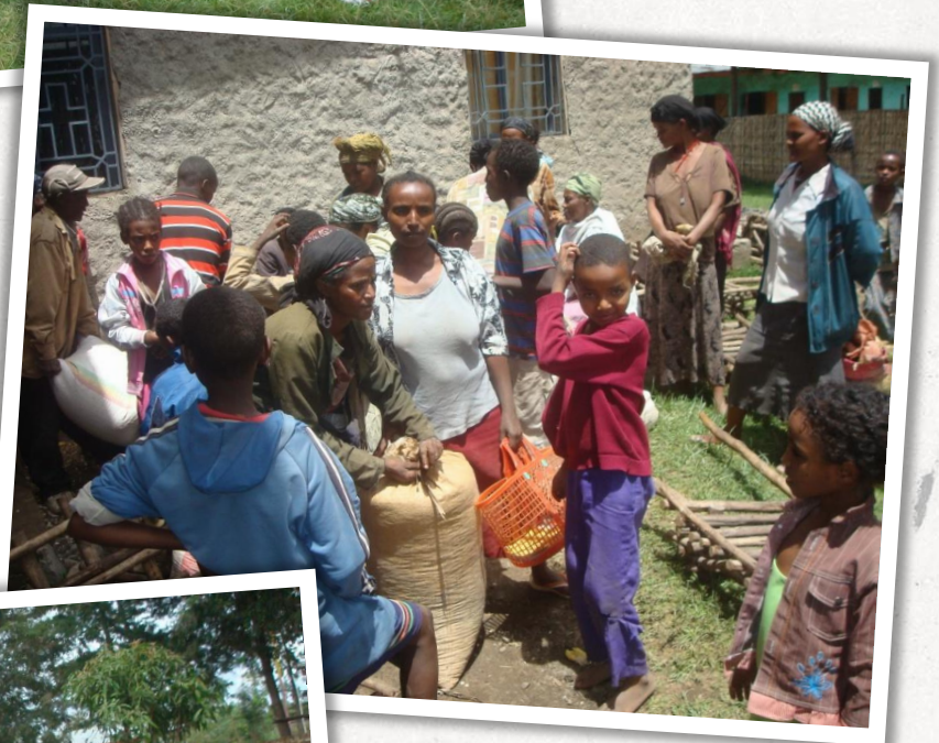
Taking food home at Sodo Kale Heywot Child Development Centre