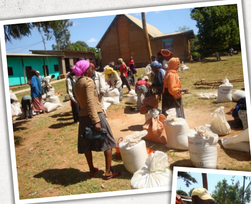
The first stage of food distribution at Wolayita Sodo Child Development Centre