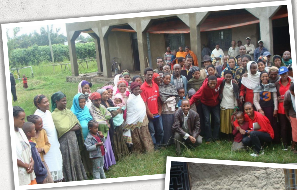
Children, caregivers and project staff expressing their joy at Shone Kale Heywot Child Development Centre