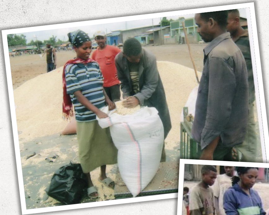
Mothers receiving their grain at Shone Kale Heywot Child Development Centre