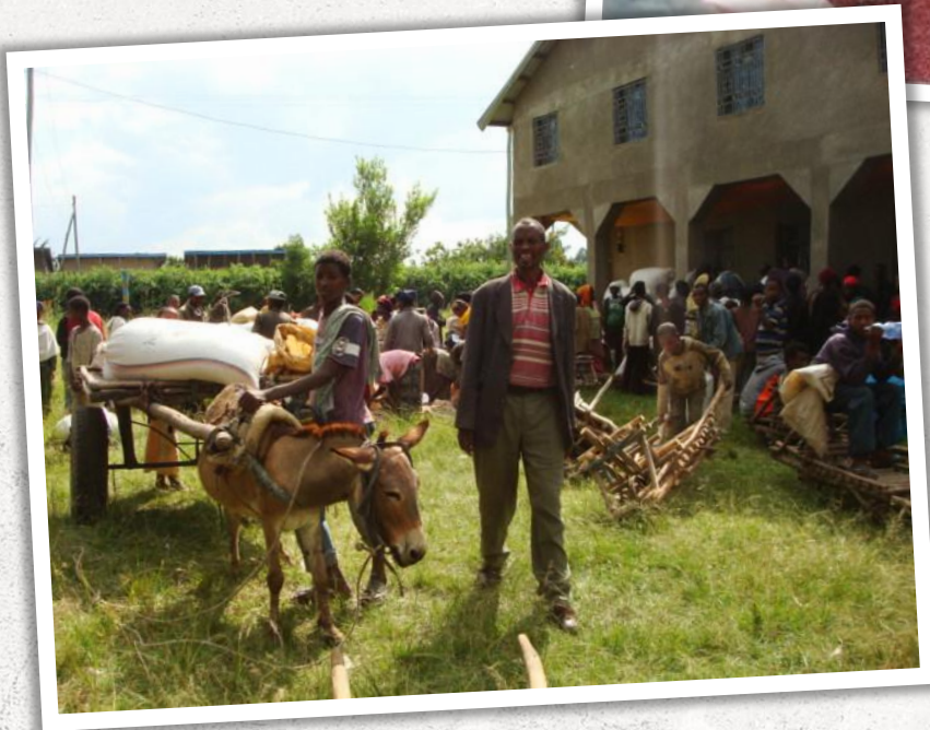
A father taking his food supplies home on a cart